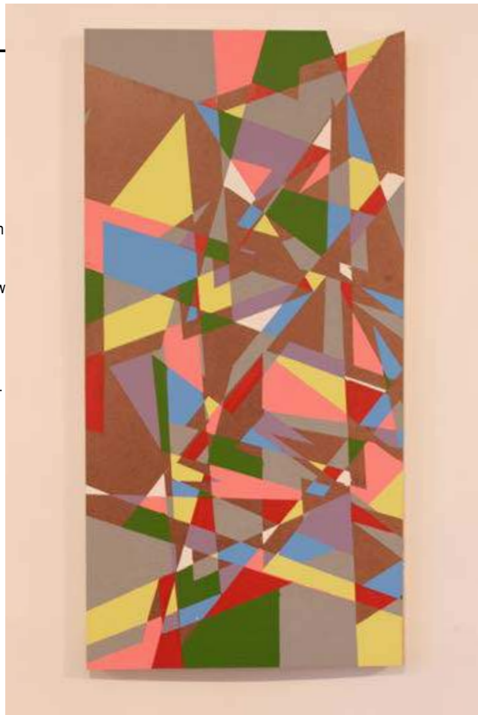
Left: Untitled (Triptych), 2014. Acrylic on masonite. 120 x 60 cm

I later then add colours that are complementary to these patterns, in search of some order. Mostly compositional order. I also like to leave other parts of the masonite board uncovered so as to make this process transparent.