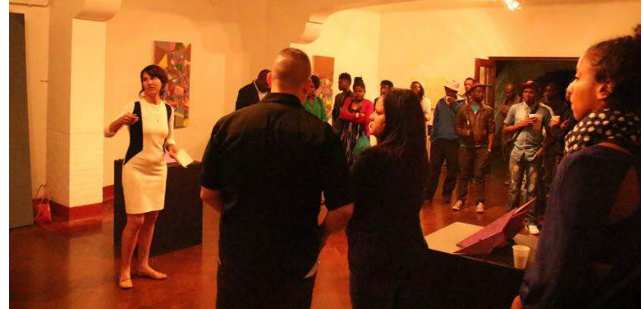
Page 17-19: Exhibition opening Images