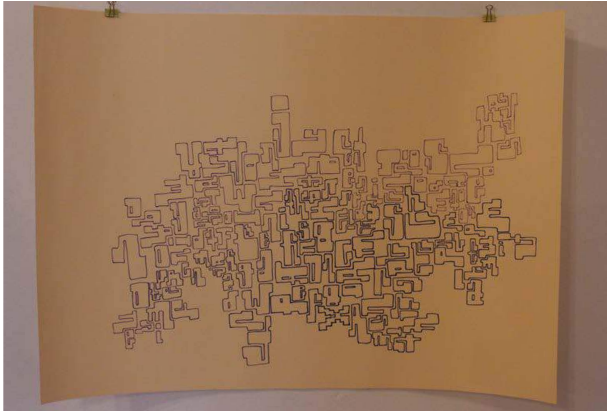
Above: Blocklettering II , 2014. Marking pen on paper. 69 x 86 cm