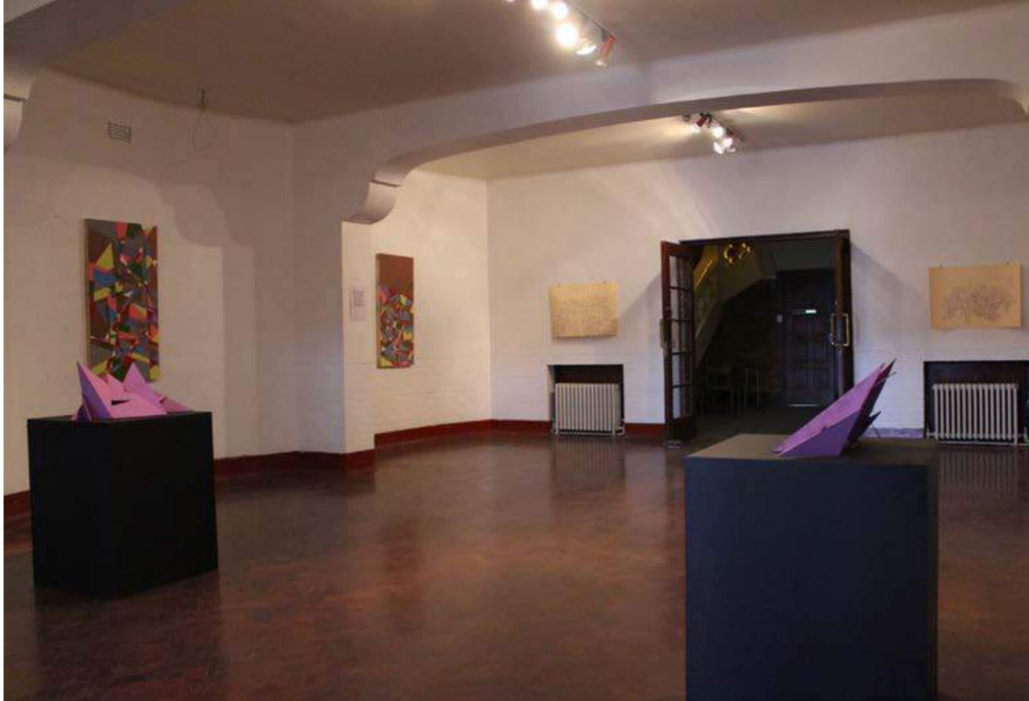
Left: Exhibition shot, 2014.