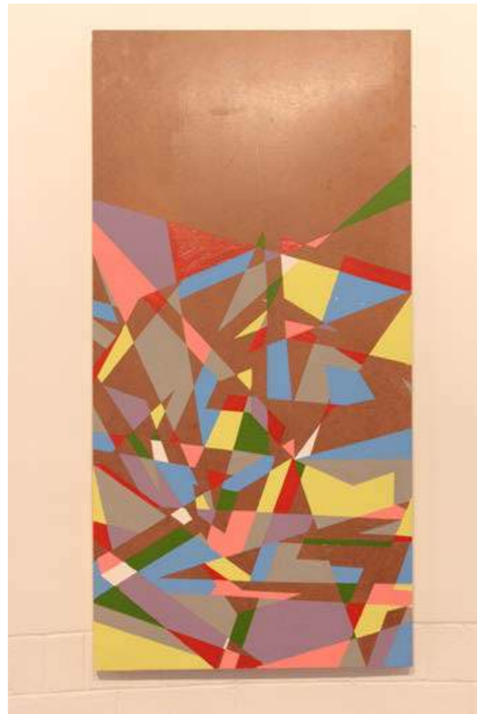
Left: Untitled (Triptych), 2014. Acrylic on masonite. 120 x 60 cm