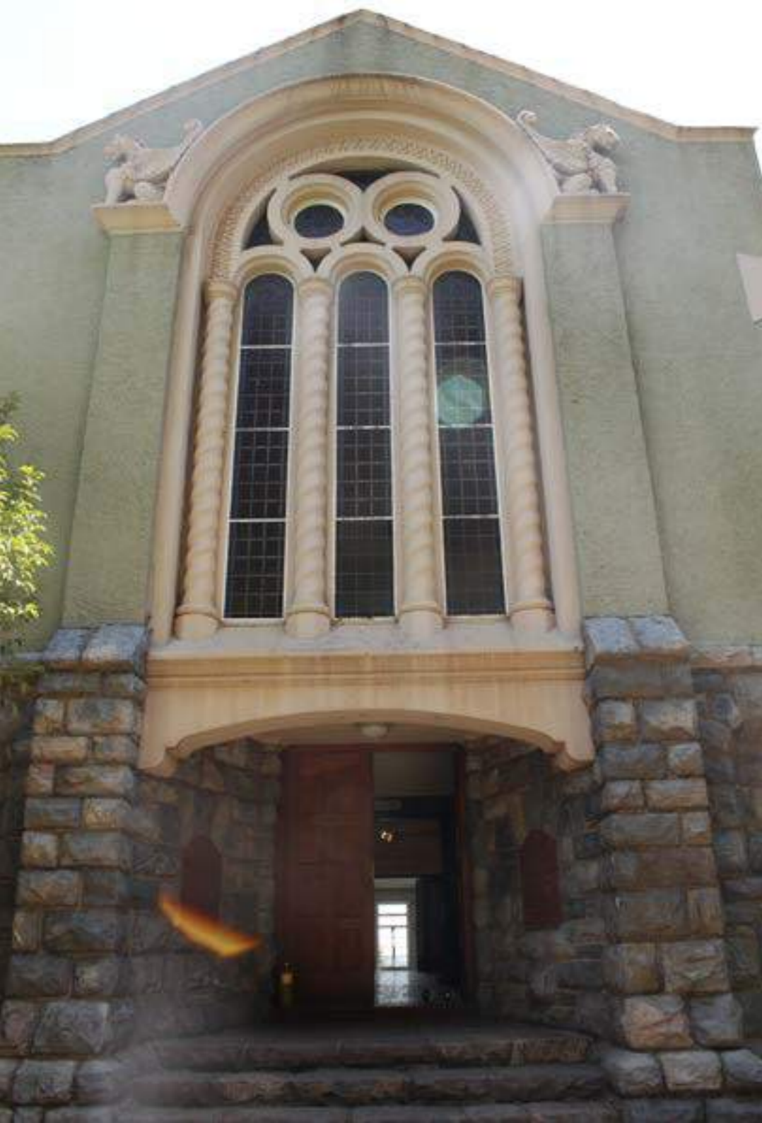
Left: National School of the Arts Gallery entrance 2014.