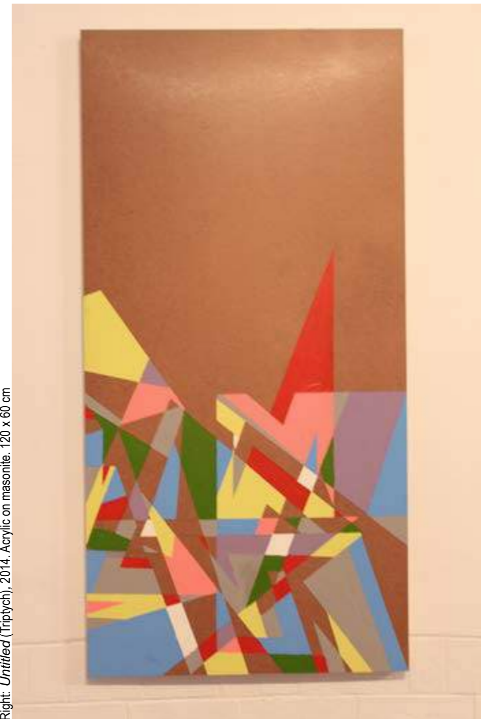
Right: Untitled (Triptych), 2014. Acrylic on masonite. 120 x 60 cm