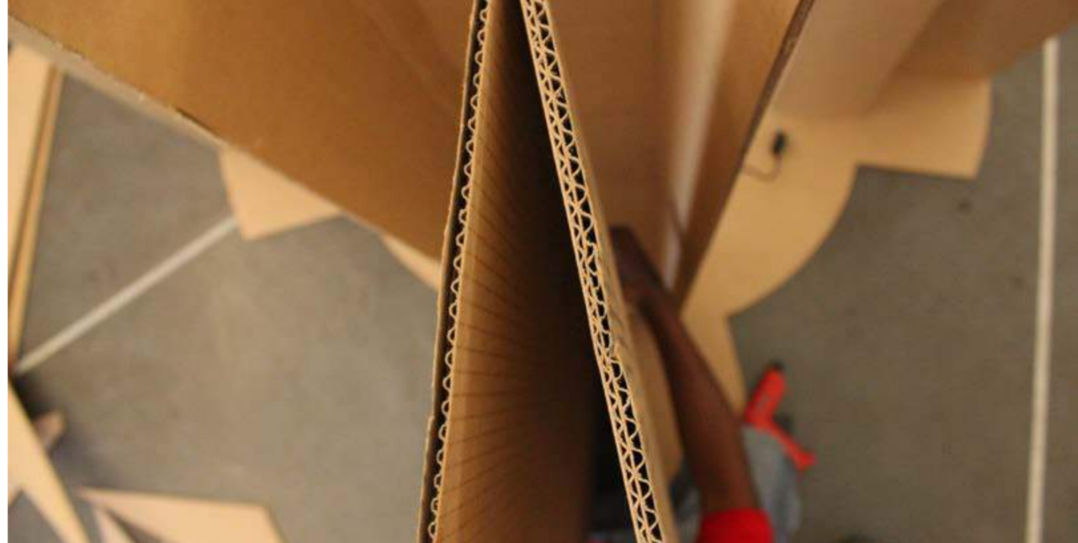
Page 8-16: Process Images