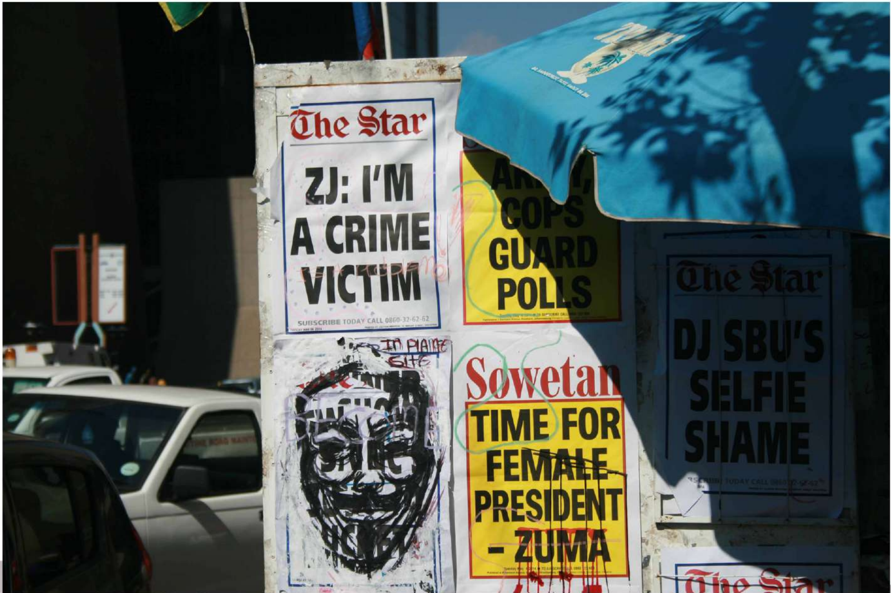
Title: Untitled Date: May, 2014 Location: Marshelstown, Johannesburg About the artwork: This artwork was part of 'TheOpenCityProject Catalogue we were working on with Khanya College. The technique was experimental and we worked with many different mediums across the JHB CBD.