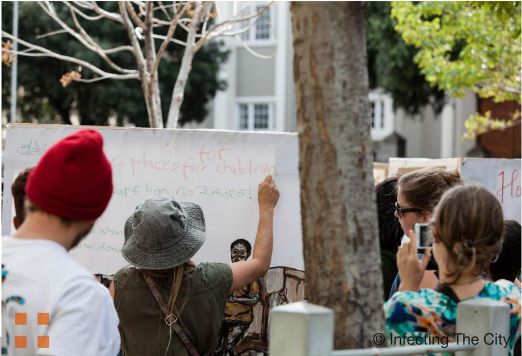
Title: Untitled Date: March, 2015 Location: Church Square, Cape Town About the artwork: Infecting The City - 2015. The installation was based on the post democratic land evictions in Cape Town.