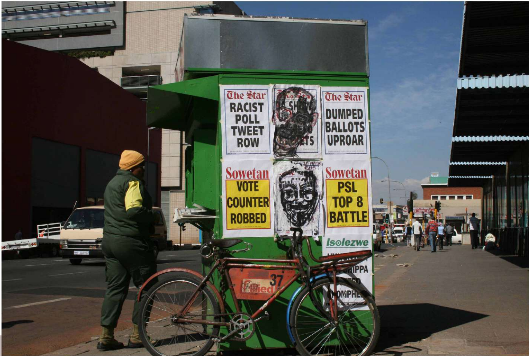
Title: Untitled Date: May, 2014 Location: Marshelltown, Johannesburg About the artwork: This artwork was part of 'TheOpenCityProject Catalogue we were working on with Khanya College. The security guard was random