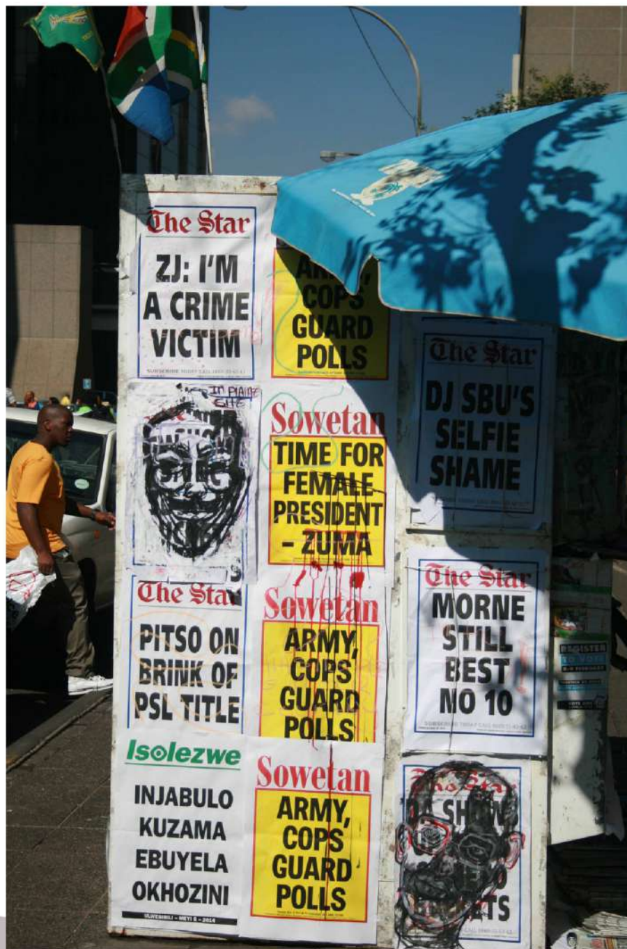
Title: Untitled Date: May, 2014 Location: Marshalltown, Johannesburg About the artwork: This artwork was part of 'TheOpenCityProject Catalogue we were working on with Khanya College.