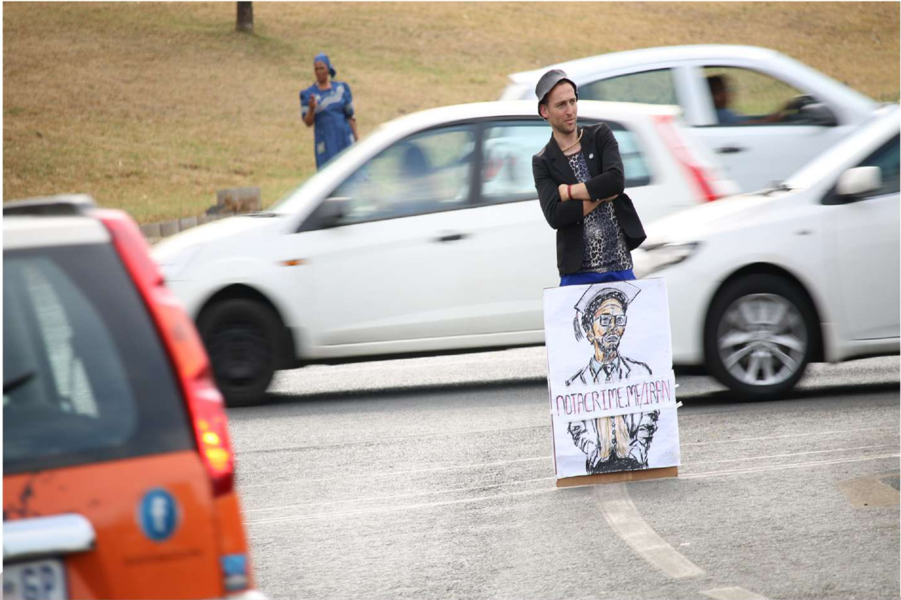
Title: Paint The Change - #NotACrime Campaign Date: November 2015 Location: Mill Park, Johannesburg About the artwork: This was a public performance piece. It was conceptualized around the sub-culture of street vendors.