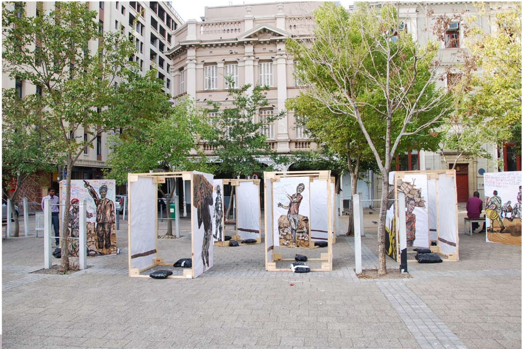
Title: Untitled Date: March, 2015 Location: Church Square, Cape Town About the artwork: Infecting The City - 2015. The installation was based on the post democratic land evictions in Cape Town.