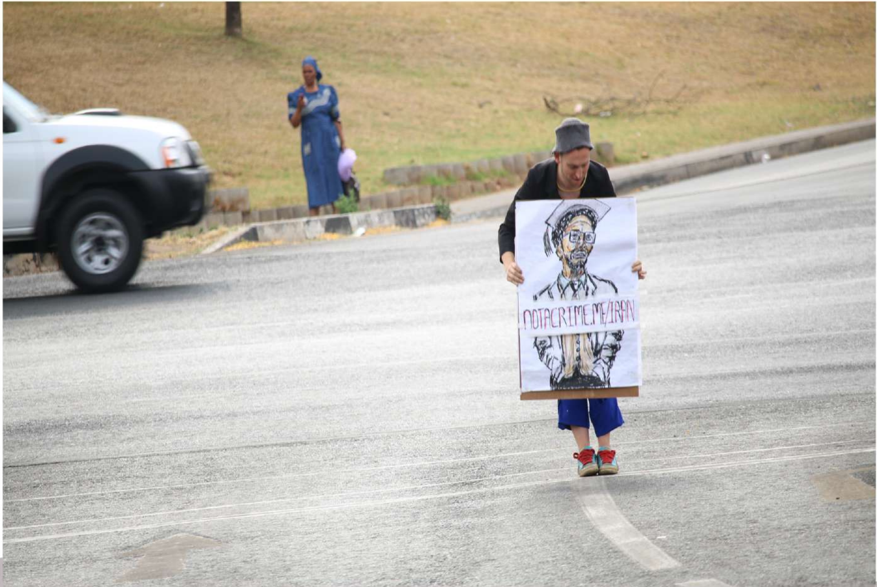
Title: Paint The Change - #NotACrime Campaign Date: Novemeber 2015 Location: Mill Park, Johannesburg About the artwork: This was a public performance piece. It was conceptualized around the sub-culture of street vendors.