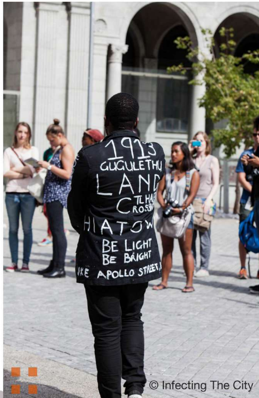
Title: Untitled Date: March, 2015 Location: Church Square, Cape Town About the artwork: Infecting The City - 2015. The installation was based on the post-democratic land evictions in Cape Town.