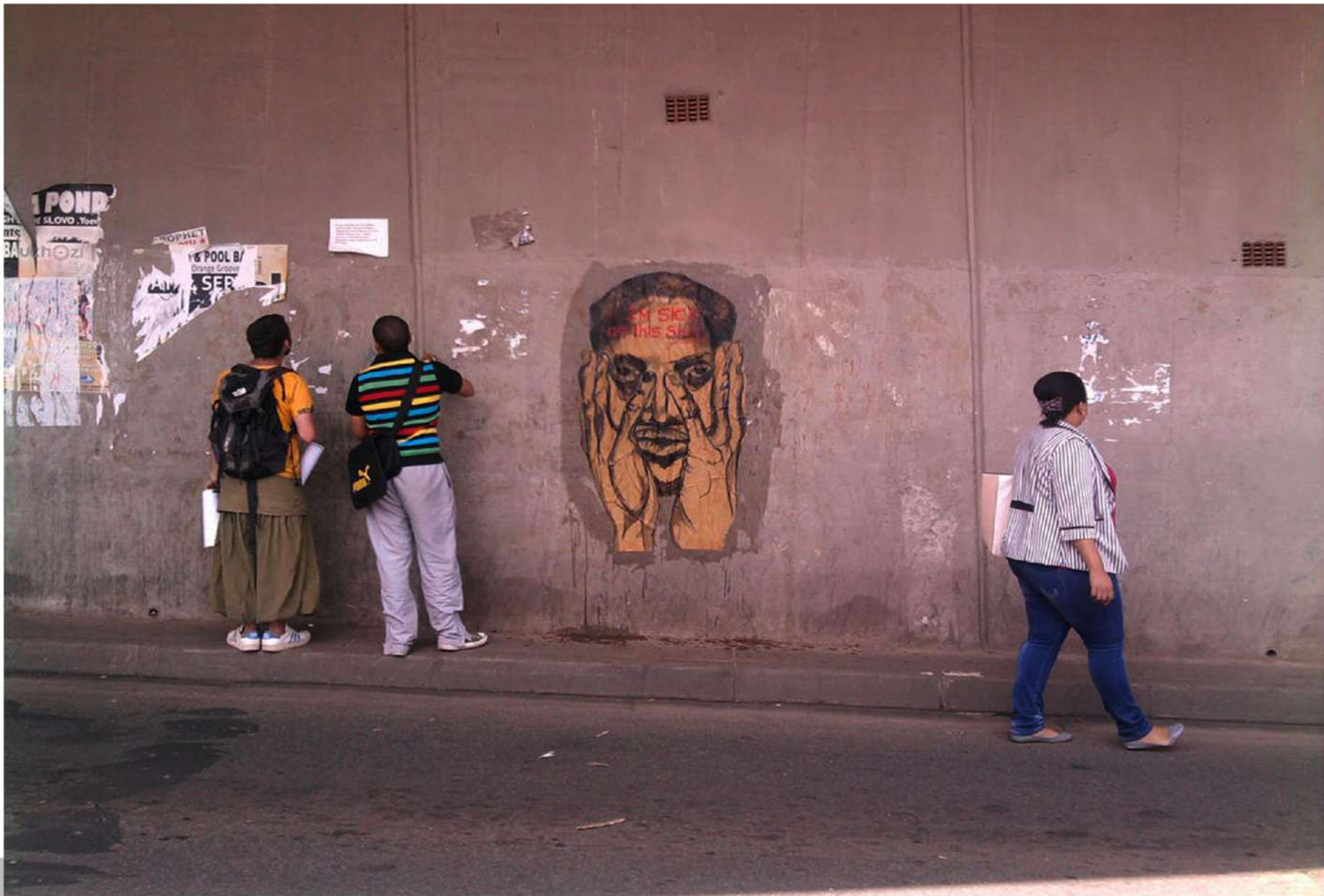
Title: Im Sick of This Shit Date: October 2013 Location: New Doornfontein, Johannesburg About the artwork: Our first artwork. The artwork was a reaction to a series of happenings earlier that year.