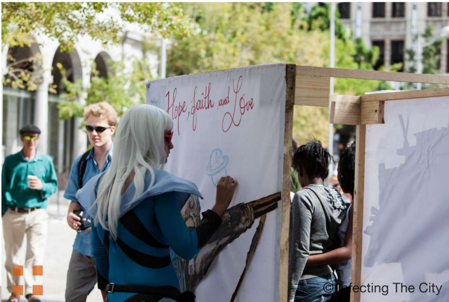
Title: Untitled Date: March, 2015 Location: Church Square, Cape Town About the artwork: Infecting The City - 2015. The installation was based on the post democratic land evictions in Cape Town.