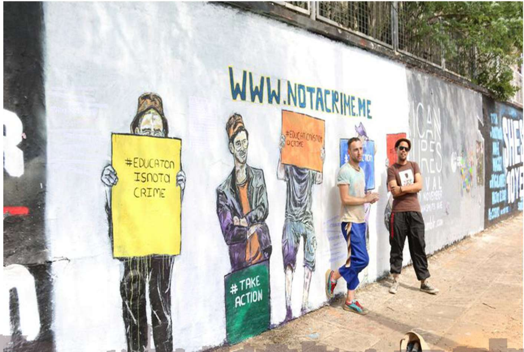
Title: Paint The Change - #NotACrime Campaign Date: November 2015 Location: cnr Jan Smuts and Empire Johannesburg About the artwork: The mural was based off the photo's we took from the performance piece.