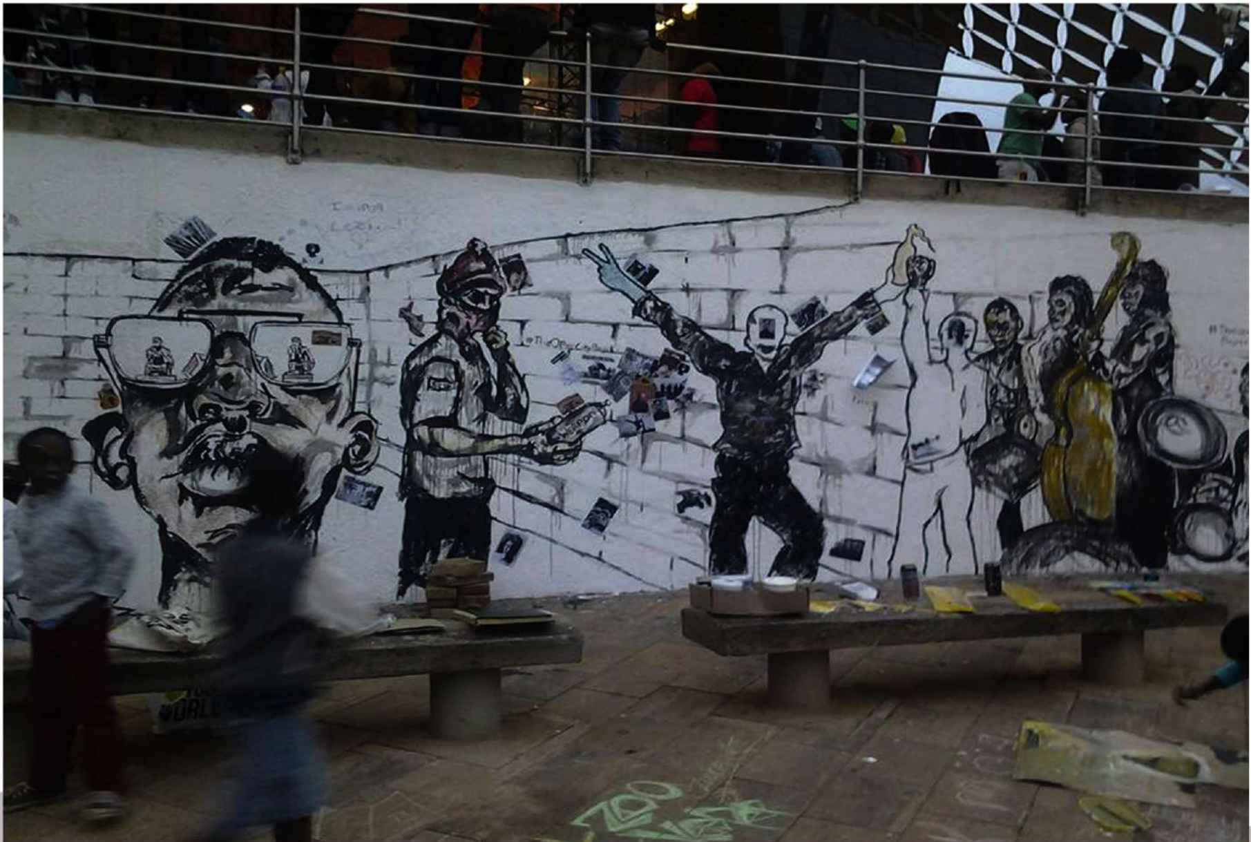
Title: Untitled Date: April, 2015 Location: Soweto Theatre, Johannesburg About the artwork: The mural was part of the 'Mind Of The Oppressed' Festival at the Soweto Theatre. The mural was interactive and we encouraged the kids to draw on the wall.