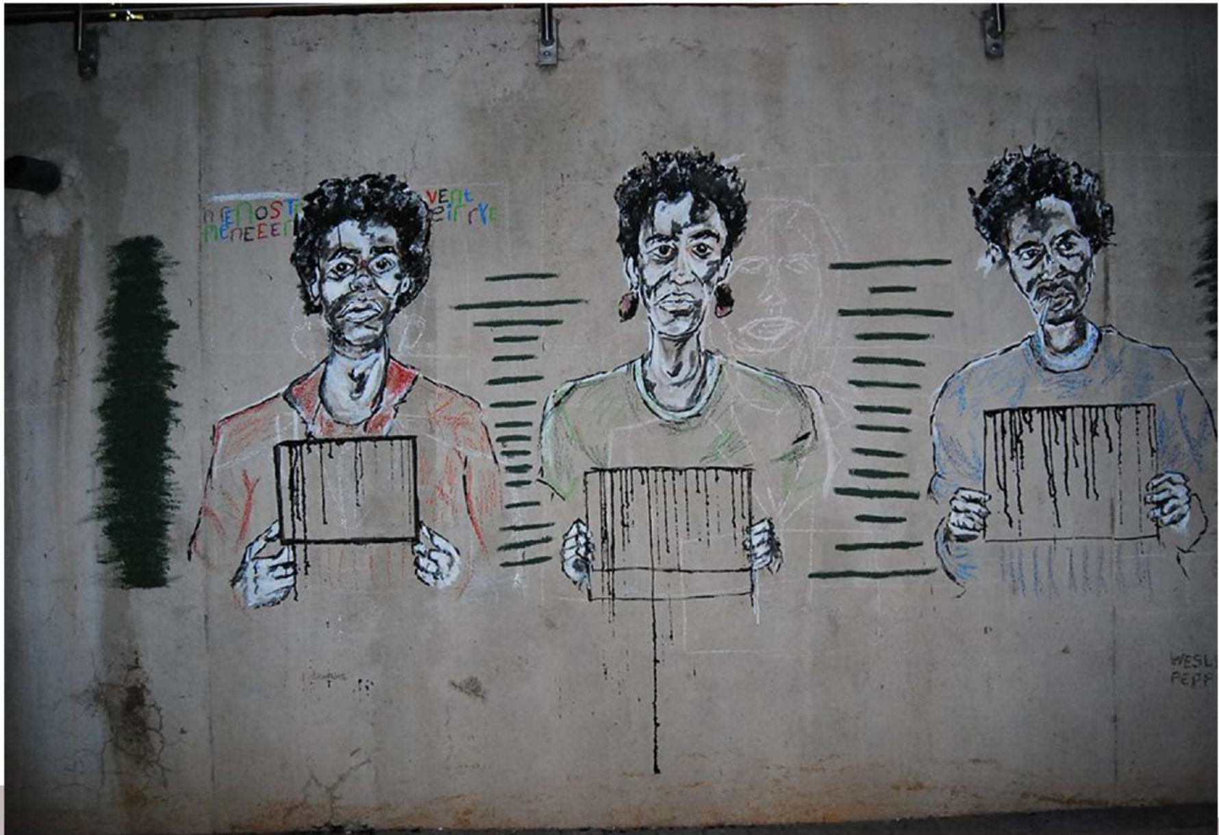
Title: Mind Of The Oppressed Date: December, 2014 Location: Soweto Theatre, Johannesburg About the artwork: This mural was part of the 'Mind Of The Oppressed' Festival at the Soweto Theatre