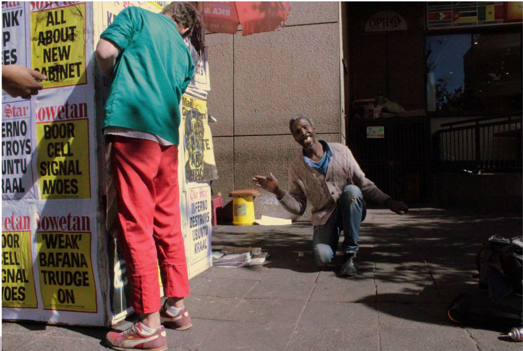
Title: Untitled Date: September, 2014 Location: Marshelltown, Johannesburg About the artwork: This artwork was part of 'TheOpenCityProject Catalogue we were working on with Khanya College. The technique was experimental and we worked with many different mediums across the JHB CBD.