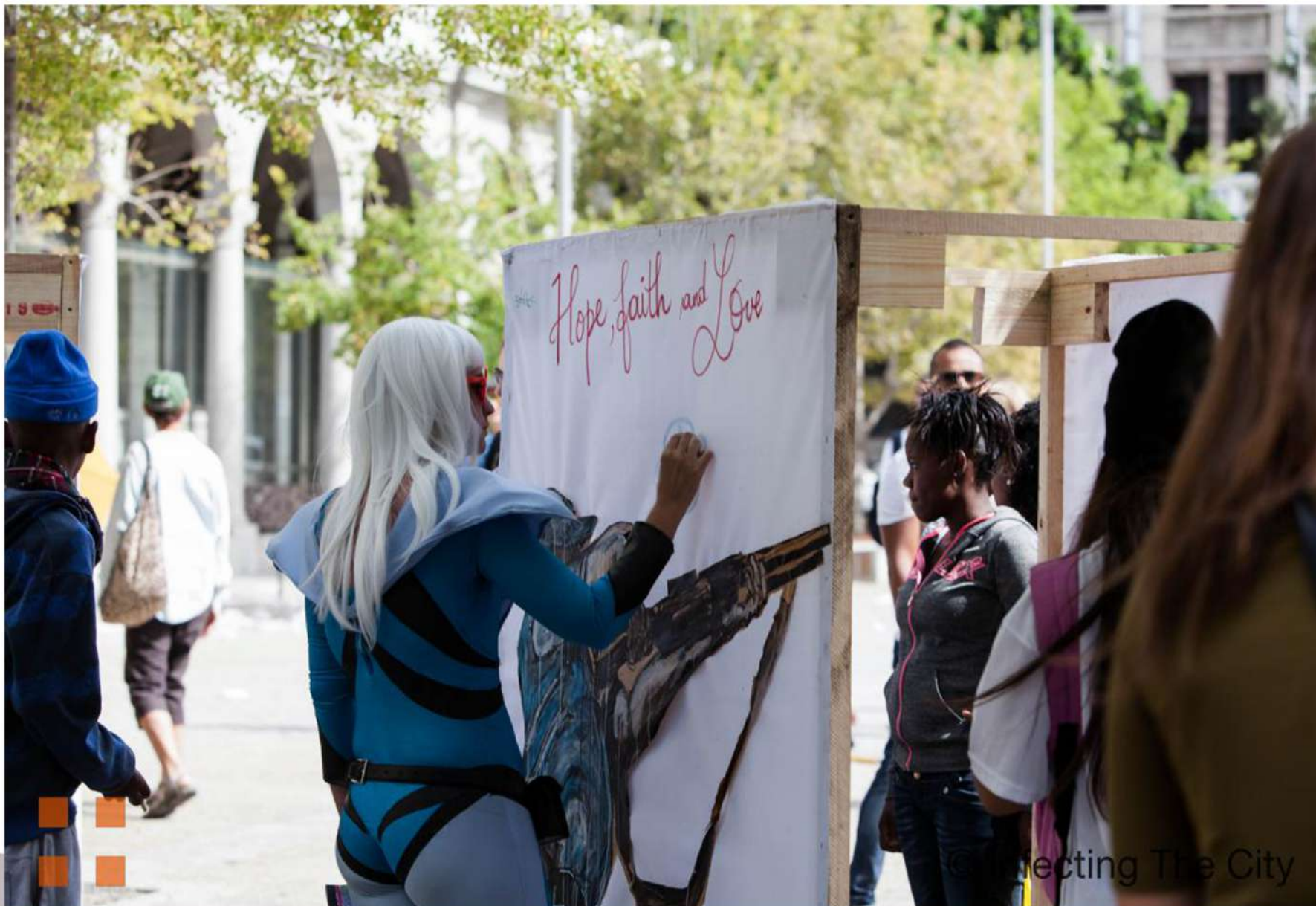
Title: Untitled Date: March, 2015 Location: Church Square, Cape Town About the artwork: Infecting The City - 2015. The installation was based on the post democratic land evictions in Cape Town.